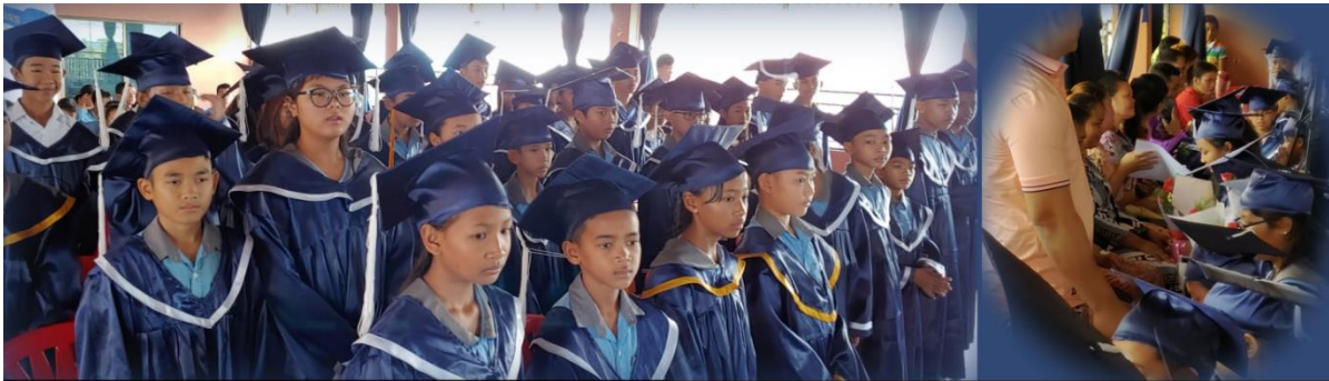
Grade 9's Awaiting to receive their certificates Grade 6's

At Emmanuel Community School (ECS) the July-September quarter had been very eventful beginning with the final school examination follow by a long holiday and end up at the beginning of a new academic year. Seventeen of our Grade 9's students sat for the state school leaving examination to secure their places in Year 10. Thank God all passed and many obtained excellent grades. We are particularly proud of the latest batch of graduates for the reason that almost all them started their first year in school at ECS when God led us to build the primary school first.